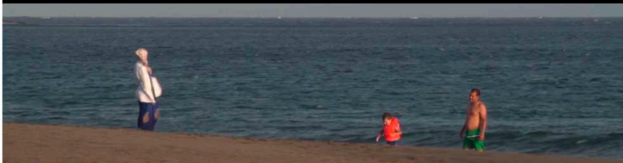
Frames from Cuerpos In.Visibles

Documental presentado como work-in-progress en el Congreso Internacional "Artes y diversidad" en Murcia, España, en noviembre de 2019.